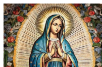
Image of Our Lady of Guadalupe

Cub Scout 13 & Troop 31 Scout Meetings Parish Center